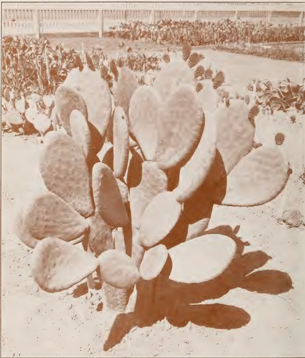
One of Burbank's Absolutely Spineless Cactus Plants, Two Years Old from Cutting.

"Some qualities Nature carefully fixes and transmits, but some, and those the finer, she exhales with the breath of the individual as too costly to perpetuate. But I notice also that they may become fixed and permanent in any stock, by painting and repainting them on every individual, until at last Nature adopts them and bakes them into her porcelain."—Emerson.